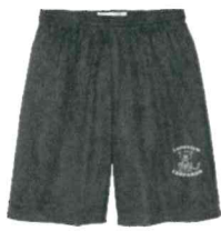
Mesh Shorts (Navy) $17.00 Youth XS-XL $17.00 Adult S-XL $20.00 2XL