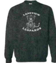
Crewneck Sweatshirt (Navy) $22.00 Youth XS-XL $22.00 Adult S-XL $24.00 Adult 2XL