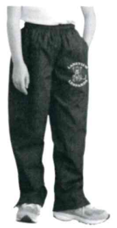
Wind Pants (Navy) $33.00 Youth XS-XL $36.00 Adult S-XL $40.00 Adult 2XL