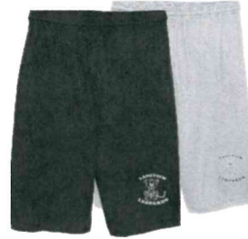
Lightweight Shorts (Grey or Navy) $17.00 Youth XS-XL $17.00 Adult S-XL $20.00 2XL