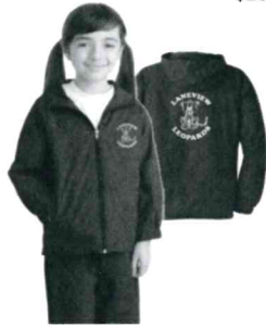
Hooded Jacket w/ Mesh Lining (Navy) $40.00 Youth XS-XL $40.00 Adult S-XL $46.00 Adult 2XL