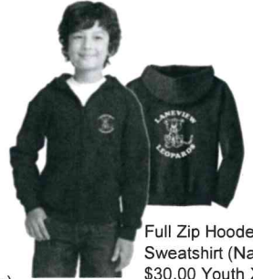
Full Zip Hooded Sweatshirt (Navy) $30.00 Youth XS-XL $30.00 Adult S-XL $35.00 Adult 2XL