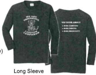
Long Sleeve T-Shirt (Navy) $16.00 Youth S-XL $16.00 Adult S-XL $19.00 2XL