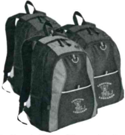
Backpack (Grey, Blue or Red) $23.00