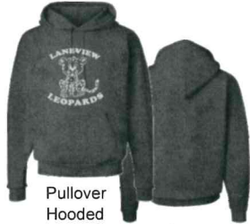
Pullover Hooded Sweatshirt (Navy) $25.00 Youth XS-XL $25.00 Adult S-XL $35.00 Adult 2XL