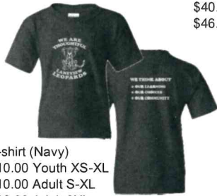
T-shirt (Navy) $10.00 Youth XS-XL $10.00 Adult S-XL $12.00 Adult 2XL