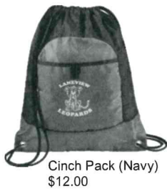
Cinch Pack (Navy) $12.00