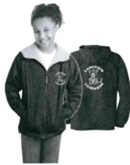
Hooded Jacket w/ Fleece Lining (Navy) $60.00 Youth XS-XL $60.00 Adult S-XL $66.00 Adult 2XL