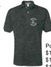
Polo (Navy) $15.00 Youth XS-XL $15.00 Adult S-XL $18.00 Adult 2XL